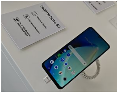
The Realme Note 50 is the volume seller