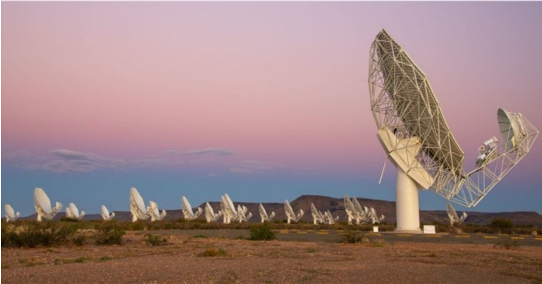
The MeerKAT radio telescope instrument located just outside Carnarvon forms part of the Square Kilometre Array project.

Astronomers in South Africa using the powerful MeerKAT radio telescope stumbled across 49 new galaxies – all by accident. The scientists, led by Dr. Marcin Glowacki from the International Centre for Radio Astronomy Research (ICRAR), were actually looking for star-forming gas in one specific galaxy. Imagine their surprise when instead of gas, they picked up signals from a whole bunch of new galaxies.