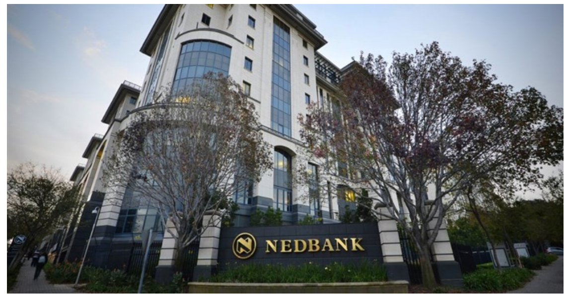
A Scopen study has found that Nedbank, Nando's and Absa the 'ideal' clients, and the most attractive brand for agencies

Nedbank, Nando's and Absa are the top three brands that professionals would like to work with says the Scopen's Best Marketer to Work with Study.