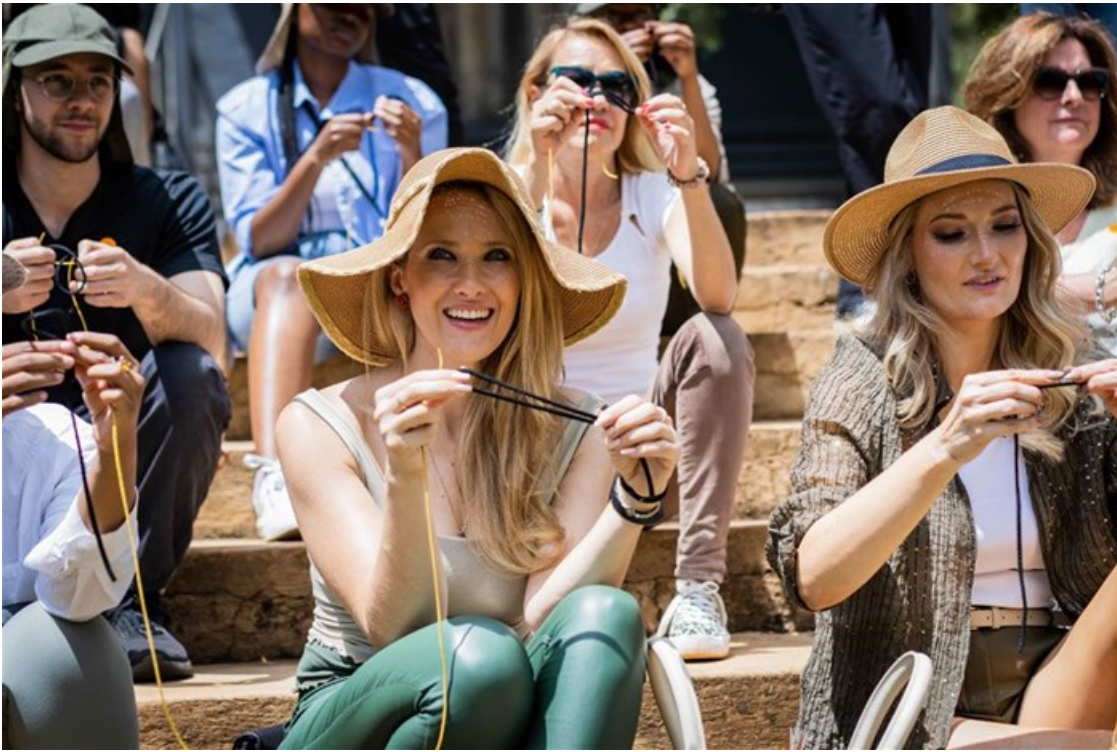
Guests learning to tie knots.

On the last day, Hazen spent the morning at the Lesedi Cultural Village on Friday morning, filming a profile piece for a local television magazine show. The week finished with a shoot of content pieces and inserts for Nat Geo Africa's owned channels, that will be used in the promotion of the series' premiere and run from 22 November across Africa. An additional fun content piece was shot with Nat Geo Explorer paleoanthropologist Keneiloe Molopyane.