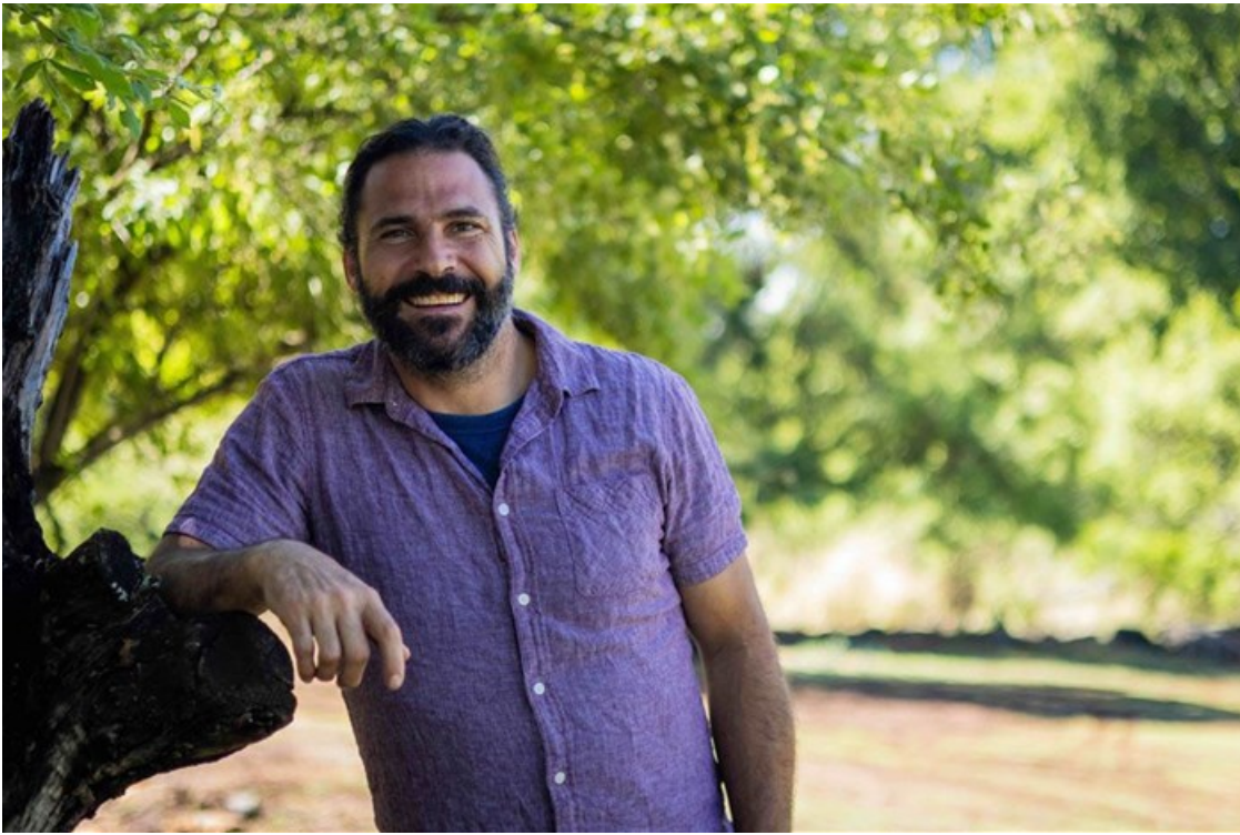
Hazen Audel in South Africa

On Wednesday, 8 November, 90 press, influencers and ad sales partners travelled to the Cradle of Humankind World Heritage Site. In the heart of the bushveld and the warmth of the South African summer, guests were welcomed to an eventful launch. On arrival, they were immediately immersed into the programming as they had to identify animal droppings and tracks, before heading into the venue.