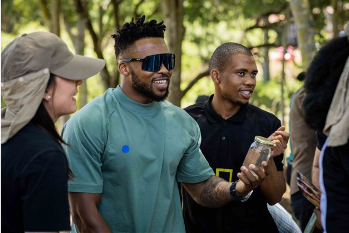
Guests purifying water.