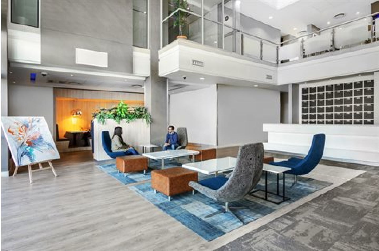
Top takeaways of the IWG CFO & Hybrid Work Survey include: