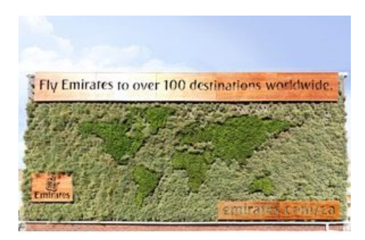
Emirates Vertical Garden

Says Mouton, "These bespoke installations break away from the ordinary, capturing attention, sparking engagement, and leaving a lasting impression. These range from eye-catching activations that grab attention to unique stages and stories, including projection mapping, vertical gardens, 3D moulding, pop-up shops, sculpting and more."