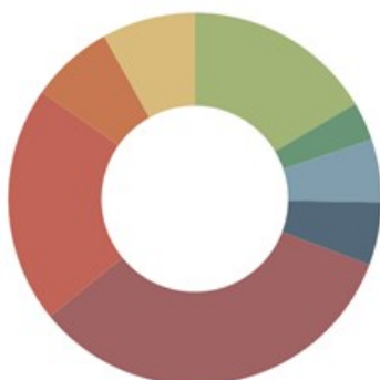
Projected mobile network operator revenue from A2P RCS traffic in 2025.

A2P messaging, which involves sending texts from a business-operated software application to a consumer's device, is emerging as a game-changer in the digital communication landscape.