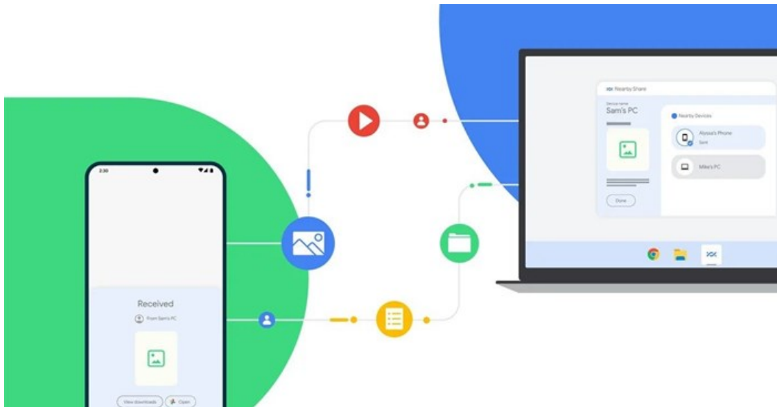
Android Nearby Share comes to Windows.

Windows PC and Android mobile device users have long been forced to look on in envy as Mac users easily transfer files with iPhones and iPads. Google and Microsoft have made major strides to bring that same functionality to Windows and Android users, first with the Phone Link - a Microsoft service also available for iPhone - and now Android Nearby Share on Windows.