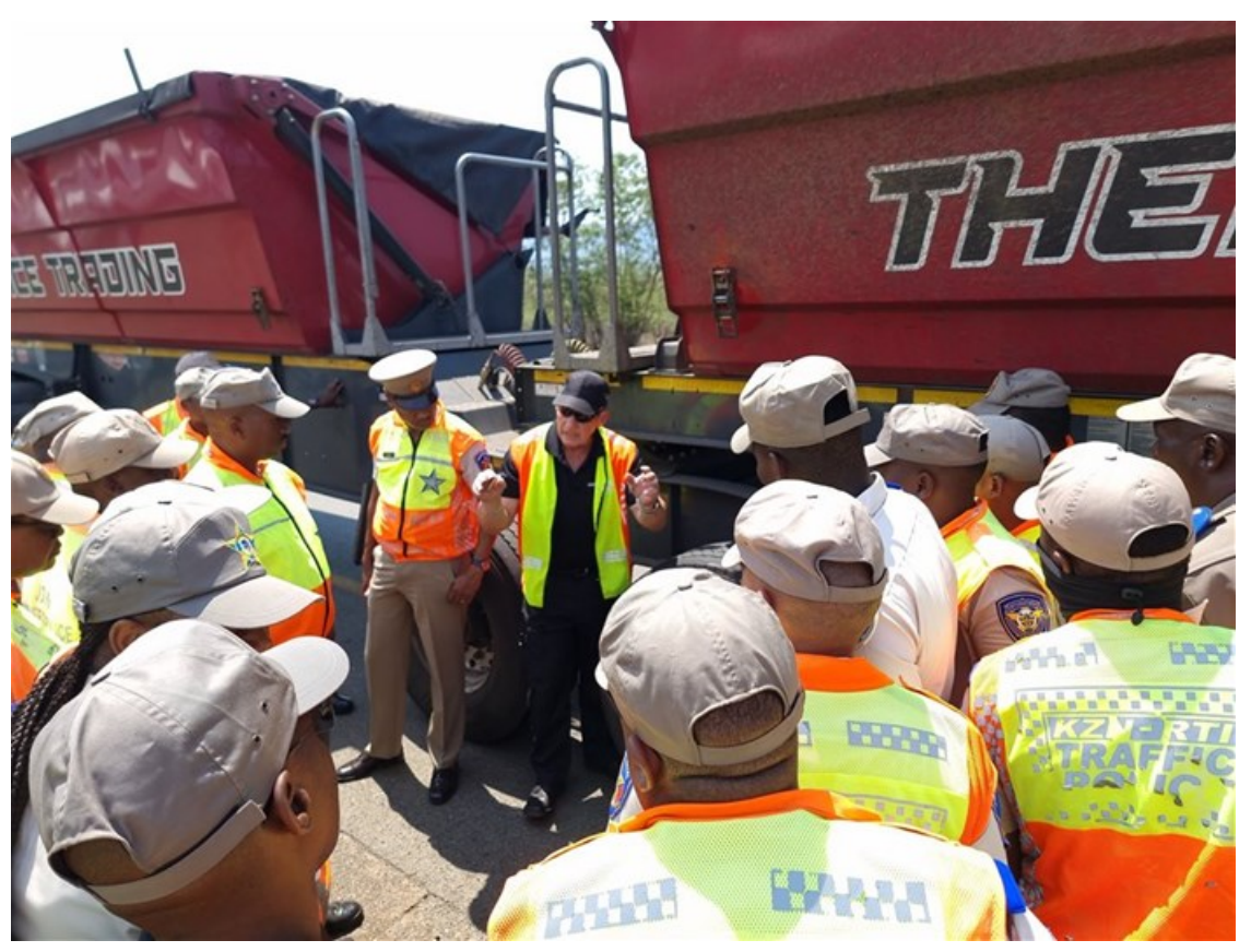
Phelps empowering officers to enforce tyre-related laws, check for tyre wear patterns, damage and roadworthiness of a tyre

Says Phelps, "Road users need to know the dangers of operating vehicles with worn or poorly inflated tyres, and traffic officers need to be able to identify and weed out unroadworthy tyres and vehicles."