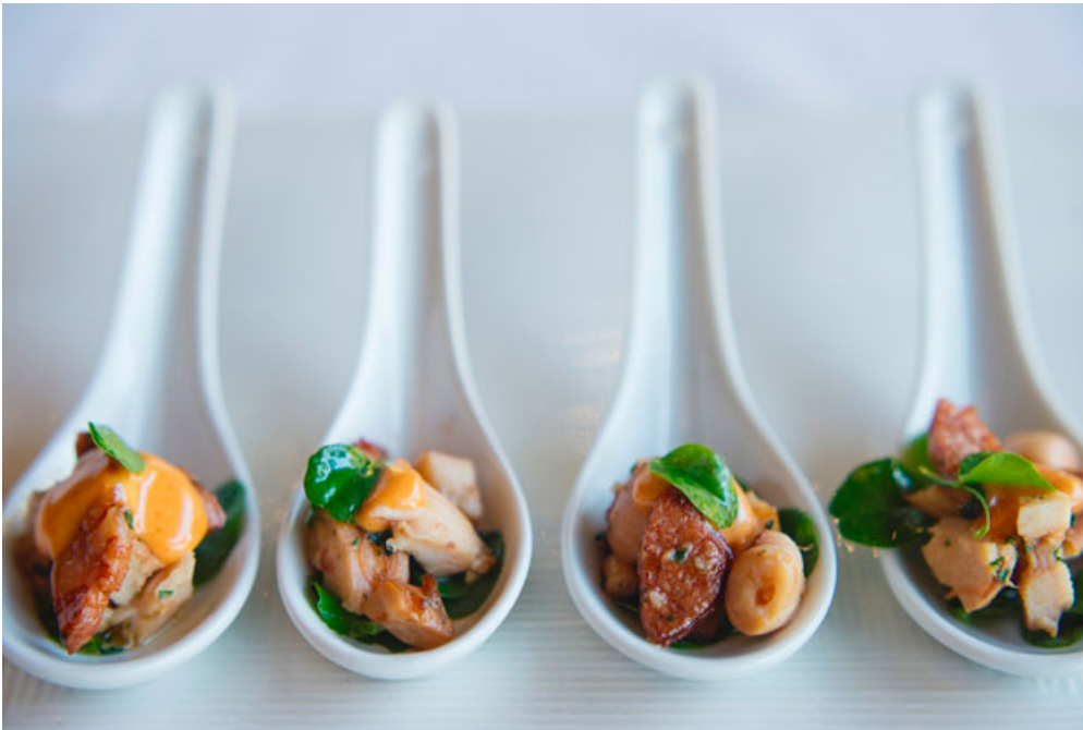
Octopus with Chorizo

Her greatest find: truffle honey, which she now makes herself, infusing local honey with truffle oil. It's delicious, as the sample given to all guests at the launch attests. My personal favourite: smoked salmon drizzled with truffle honey and a squeeze of lemon!