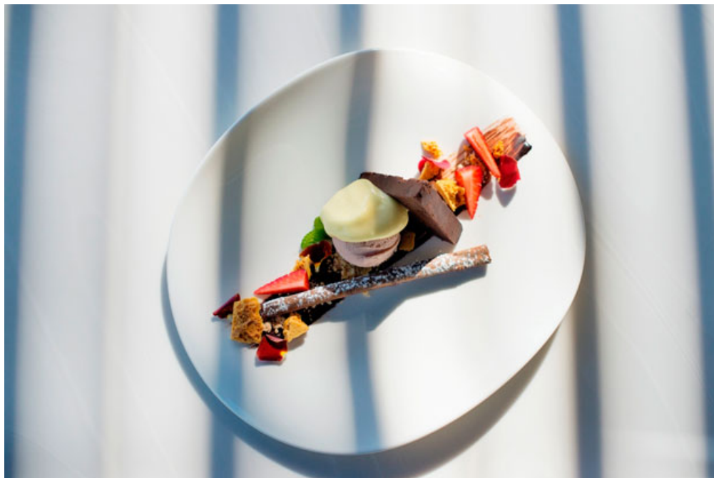
Dark Chocolate Marquise

Kilpin hit the sweet spot with a medley of lemon posset, a granadilla and yoghurt sorbet, berry coulis, white chocolate shortbread; followed by dark chocolate marquise with raspberry ice cream, chocolate soil, orange foam and chocolate cigar; and a yoghurt panna cotta with rose vanilla ice cream, phyllo cigar, star anise and vanilla poached pear.