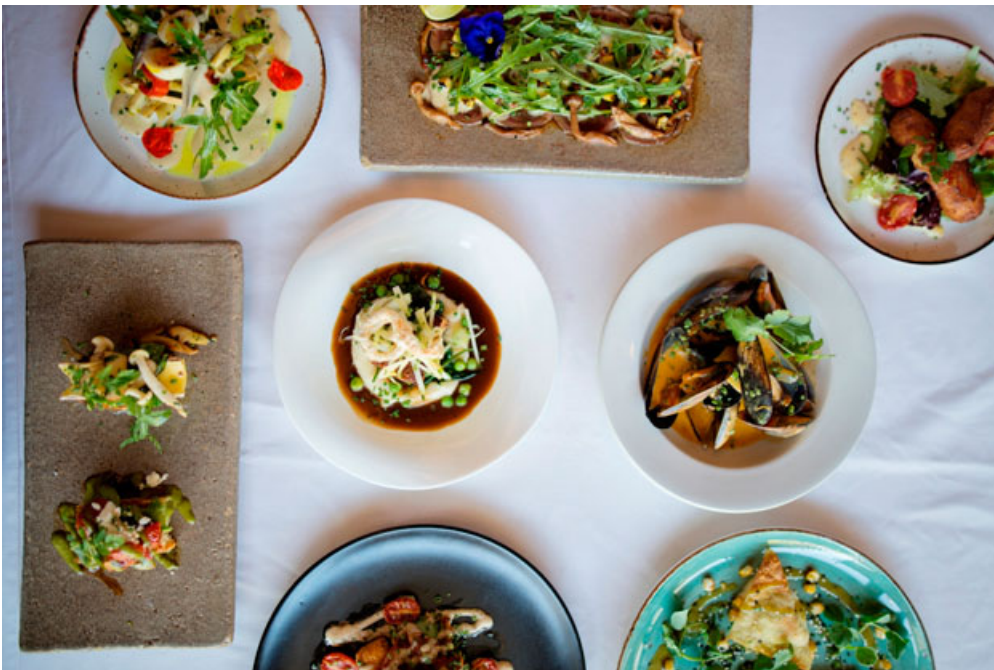
BistroSixteen82 Tapas Selection

The new menu is a veritable feast of flavours, with dishes so beautifully plated that you want to preserve the memories in photographs as much as eat them. The media were treated to a sample of the entire menu, accompanied by wines from Steenberg's adjacent winery.