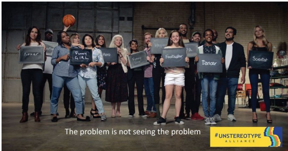
Unstereotype Alliance: The problem is not seeing the problem

This Women's Day in SA, we welcomed news that the Loeries has joined forces with UN Women's Unstereotype Alliance initiative, to launch its South Africa chapter, set to use the advertising industry as a force for good to drive positive change all over the world. We also learn what to expect from the UN Women South Africa multi-country office's Loeries 2019 masterclass with Dove, on advertising leading society.