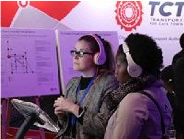
The two-day conference provided insight, guidance and training to African cities to attract and negotiate international finance and investment.

For more, visit: https://www.bizcommunity.com