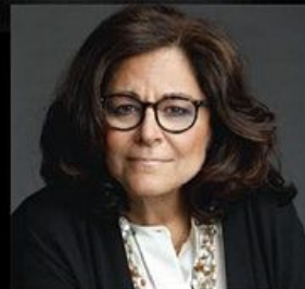
FERN MALLIS Special Guest Presenter

FOR FREE ACCESS GO TO EMERGERUNWAYNYC.COM