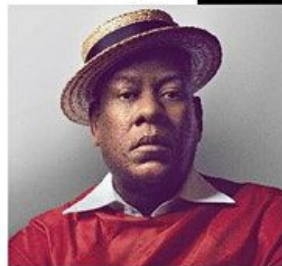
ANDRE' LEON TALLEY Special Guest Presenter