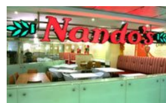
Madiba Birthday Celebrations: Nandos