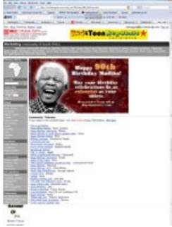
Madiba Birthday Celebrations: Bizcommunity

Tomorrow, Friday, 18 July 2008, is the 90th birthday of former South African president Nelson Mandela and Bizcommunity.com explores the many initiatives marking our beloved Madiba's special day, including our own tribute page which we invite our readers to add to.