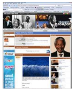
Madiba Birthday Celebrations: Blue World