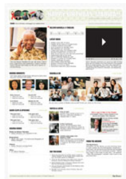
Madiba Birthday Celebrations: The Times