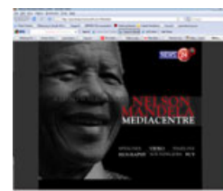
Madiba Birthday Celebrations

The Citizen will be donating 50 cents from the sale of each Citizen newspaper tomorrow in order to commemorate and honour the role Madiba has played as a living legacy in South Africa. All funds collected will be donated to the Mandela Rhodes Foundation ( www.mandelarhodes.org ).