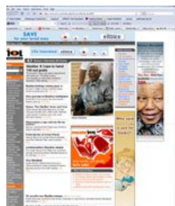
Madiba Birthday Celebrations