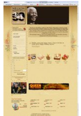
Madiba Birthday Celebrations: SA Tourism

To wish Madiba happy birthday personally via SABCnews.com and to view its special feature online, go to www.sabcnews.com/features/madibas_90th_birthday/ .