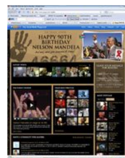
Madiba Birthday Celebrations: Zoopy.com

"Users can add videos, photos and comments at www.zoopy.com/madiba and include them on Madiba's page by tagging their media with 'madiba90'. To add to the celebrations on Friday, we'll also be featuring some of the uploaded birthday videos on the Zoopy homepage throughout the day."