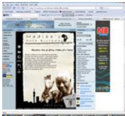
Madiba Birthday Celebrations: SABC News