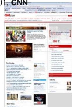
Madiba Birthday Celebrations: CNN