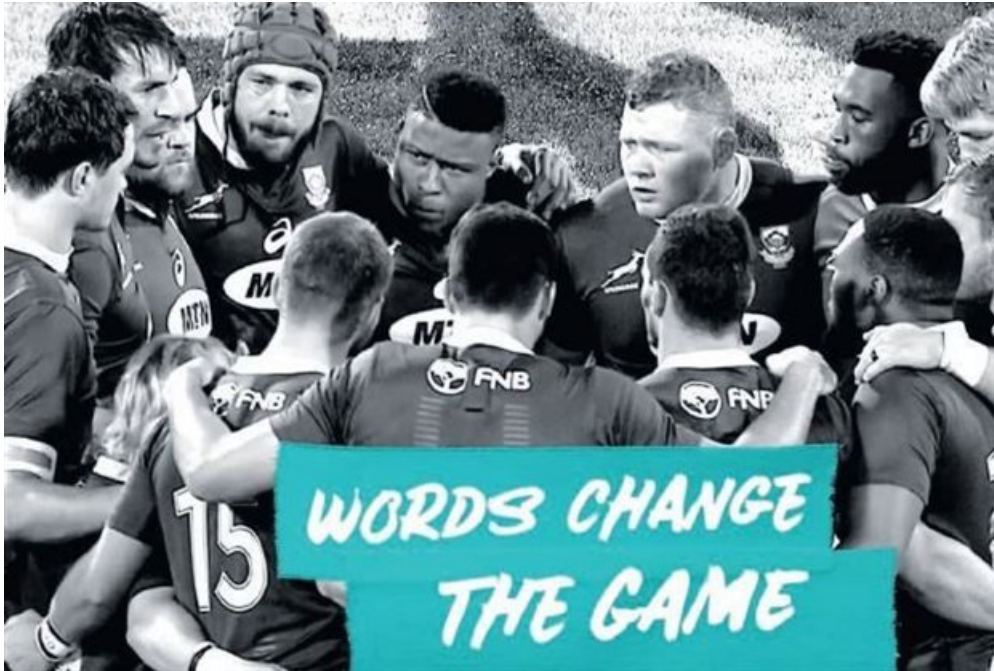
Screen grab from the ad.

FNB shares an Orchid with Grid for a thought-provoking advert, while Checkers gets half an Onion for trying to put lipstick on chemical pigs called 'beers'.