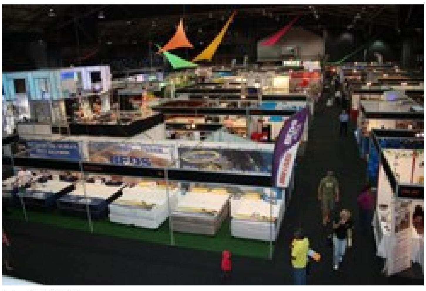
Durban HOMEMAKERS Expo