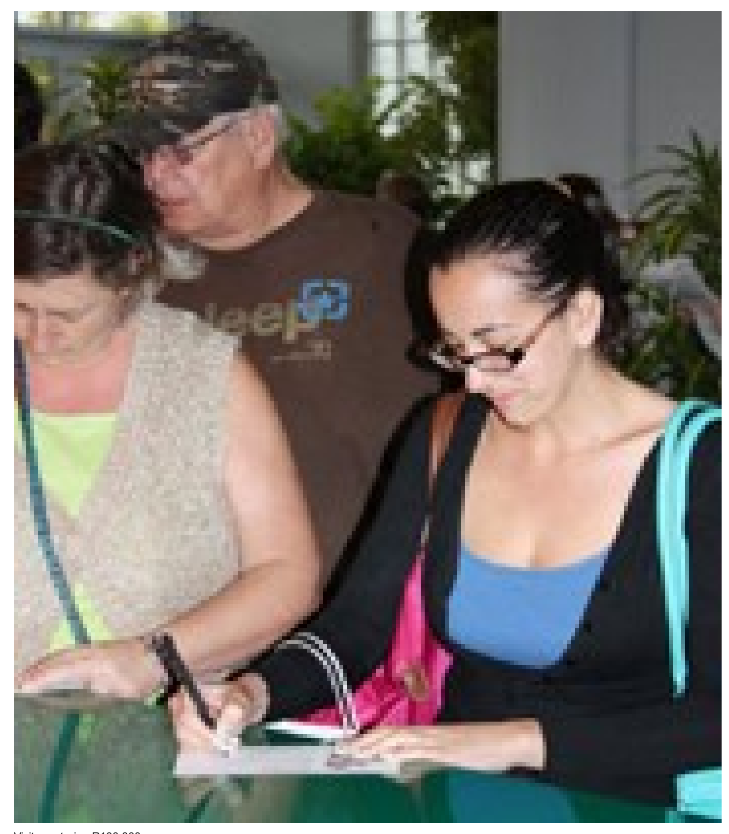
Visitor entering R100 000 comp