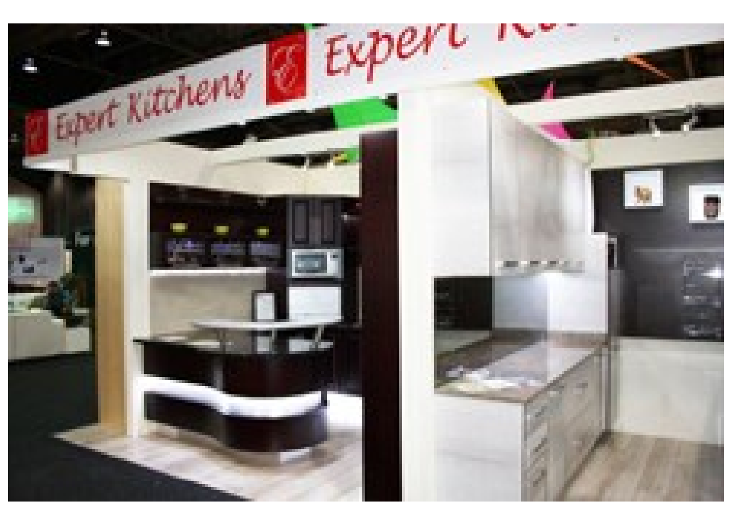
Expert Kitchen-overall winner