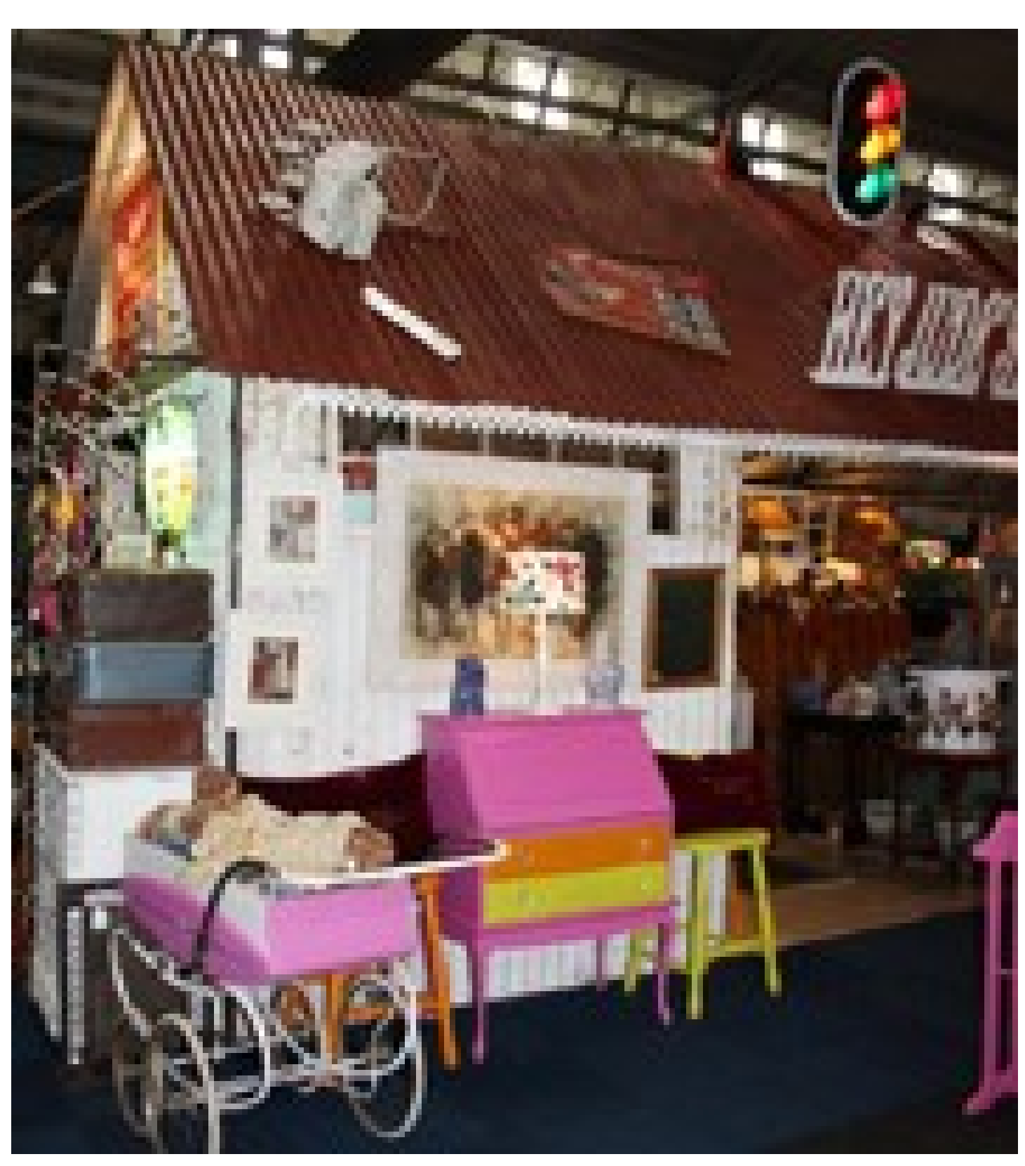
Hey Jude stand