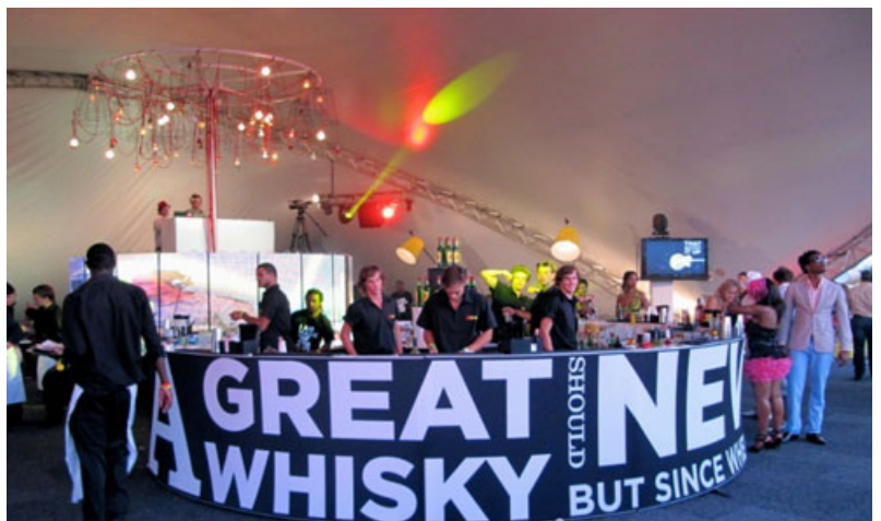
The new Thirst Saturn bar units launched at this year's J&B Met VIP marquee

Thirst Bar Services have soared to the top of South Africa's premium mobile bar market. The last 12 months has seen the company grow at a phenomenal rate, with Thirst being present at a huge majority of South Africa's premium events, offering a complete mobile bar solution which includes sushi, cocktails, premium coffee, smoothies and even mobile DJ's. Thirst's bar options have also grown but have kept in line with their "premium" status and services, their bar counters are not just the run of the mill Perspex bars on wheels, Thirst bars include, their experience bars, which are made from stainless steel and can be in black, white or even branded or wrapped. The new Saturn bar is state of the art, it's 5.5 meters in diameter, lightweight, can fit up to eight bartenders and has a cloth branding surrounding it which can be branded and kept for future events and its even machine washable.