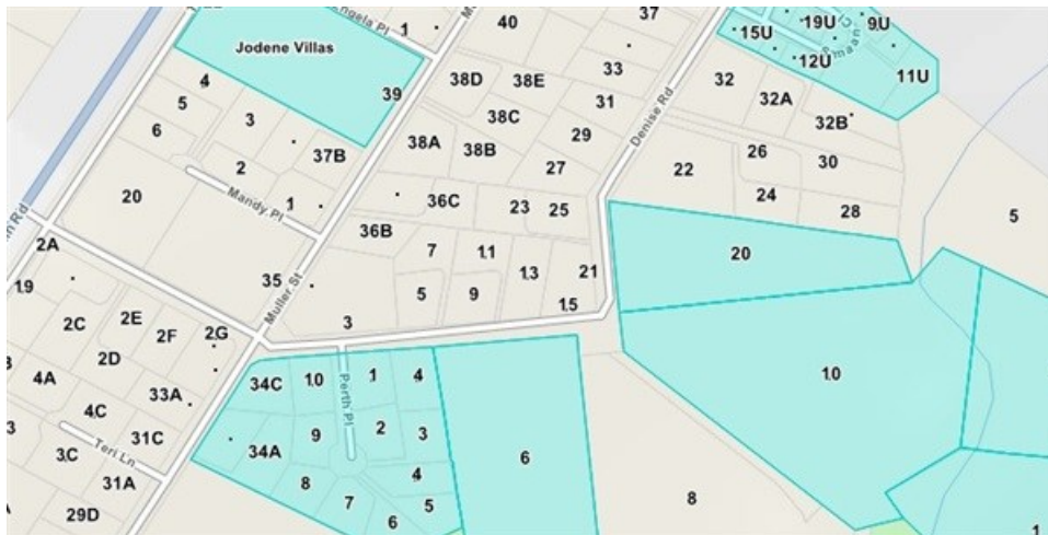
AfriGIS verified Geocoded Addresses in the Woodmead area

AfriGIS's address information/data provides valuable insights and helps you :