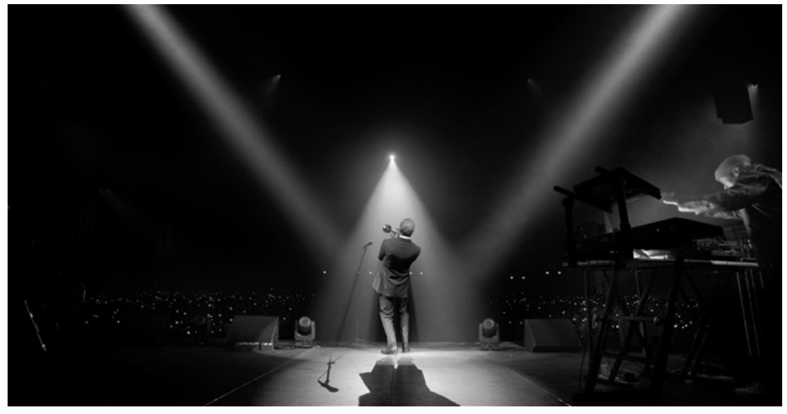
The latest in Allan Gray's catalogue of ads, Everything comes around

The latest in Allan Gray's catalogue of ads, Everything Comes Around is a black and white film that portrays the life of a jazz musician from the late 40s whose commitment to his craft is unwavering, even as musical trends come and go.