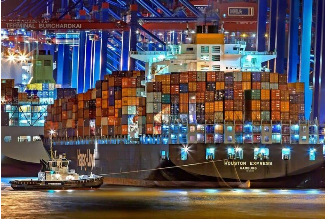
Container ships transport millions of tonnes of goods across the planet.

In the middle of this summer's shocking fires and floods came the grimmest climate science report yet from the UN's Intergovernmental Panel on Climate Change , warning of a " code red for humanity " as our use of fossil fuels continues to drive up global temperatures.