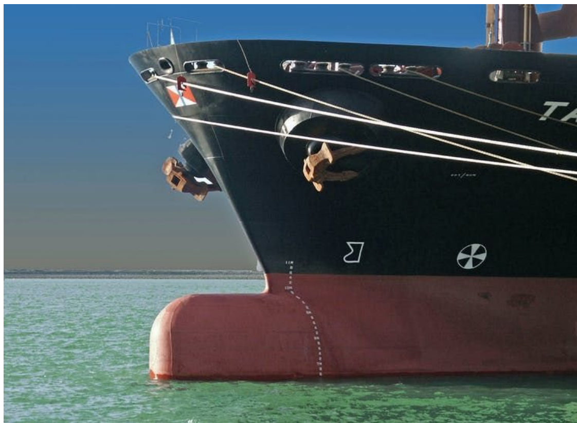
Bulbous bows are just one way ships can be designed to produce increased efficiency.

There are multiple ways to retrofit ships so they use less fuel, like adding protruding “bulbous bows” to reduce resistance from waves and upgrading ship propellers and hulls to improve fuel efficiency.