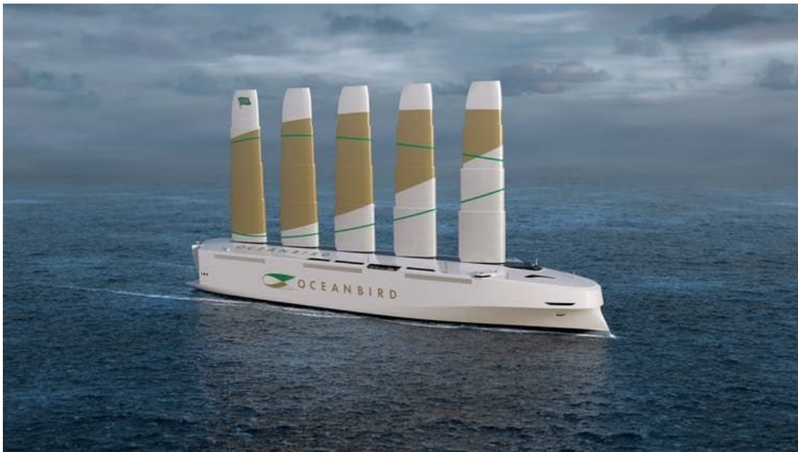
The Oceanbird ship concept, a wind-powered cargo carrier.