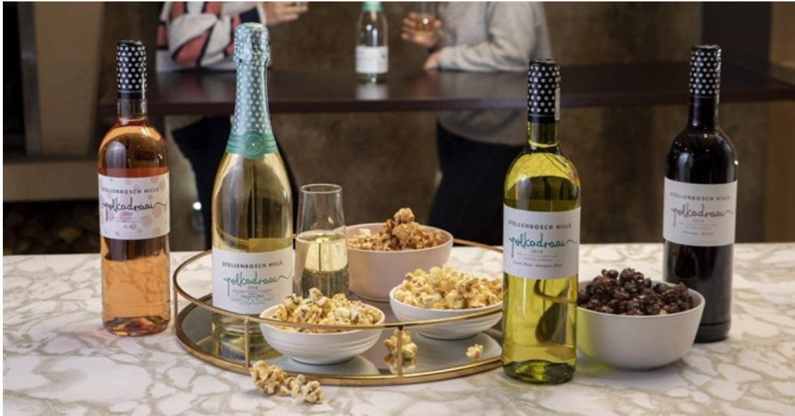
Stellenbosch Hills' Polkadraai and popcorn pairing.

Wine pairings are a fun way to taste a new range and discover flavours that mingle well together - here's why the popcorn-and-Polkadraai pairing at Stellenbosch Hills is the latest flavour of the month.