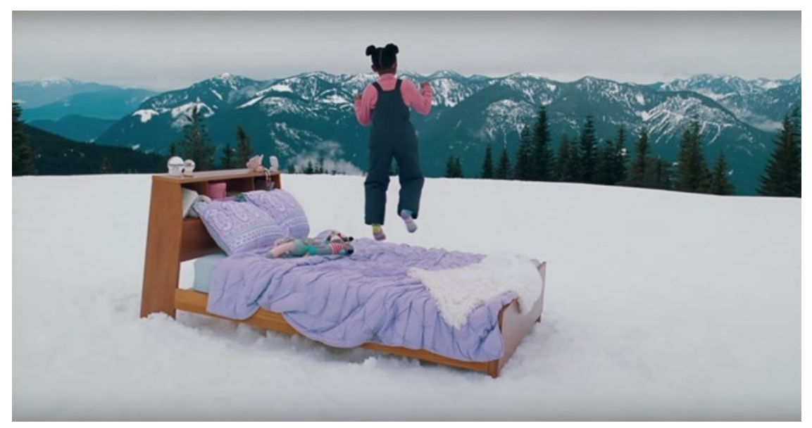
Screengrab from P&G's #LoveOverBias campaign.

As the world's top winter sports stars showed off their athletic prowess in the snow and ice of PyeongChang last month, the thirteen worldwide Olympic sponsors who have helped fund the global spectacle, outdid each other to capture the attention of a billion-strong television audience.