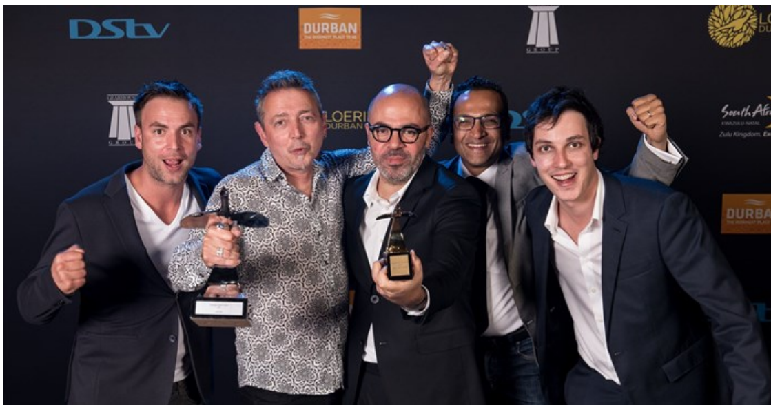
Impact BBDO MEA, Regional Agency Group of the Year at Loeries 2017.

This brought the total presented to 241 with 5 Grand Prix out of more than 3,000 entries for 800 brands, represented by 400 agencies from 18 countries across Africa and the Middle East.