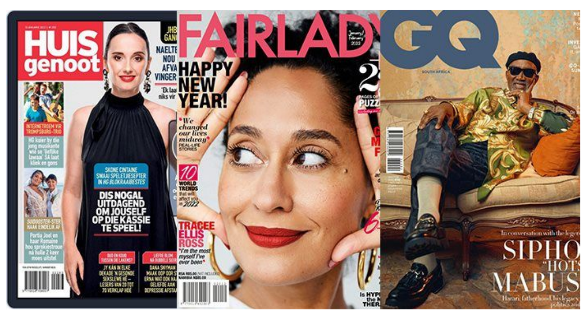
The hero of the Audit Bureau of Circulations (ABC) of South Africa Q1 2022 is digital magazines

With a steep increase from 4,510 to 125,912, the hero of the Audit Bureau of Circulations (ABC) of South Africa Q1 2022 is digital magazines.