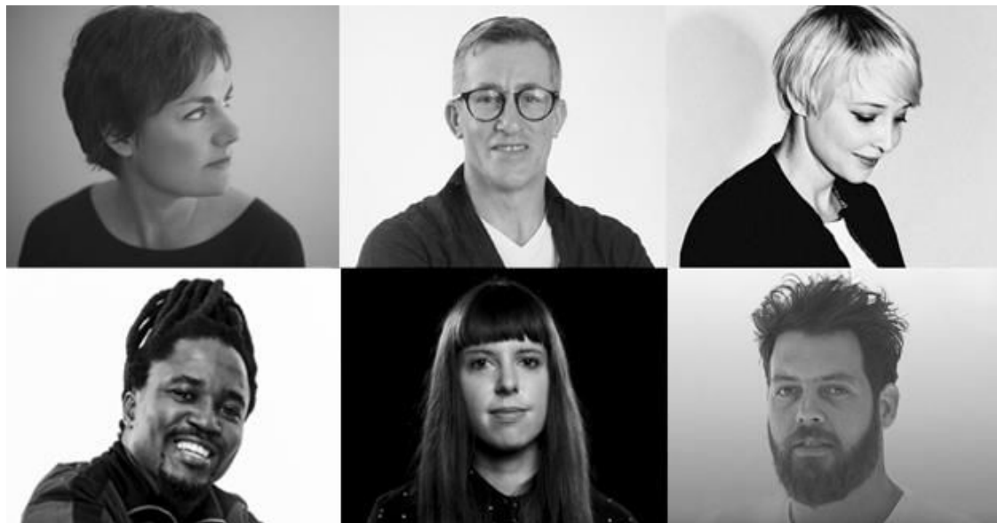
SA's Cannes Lions jury predictions...