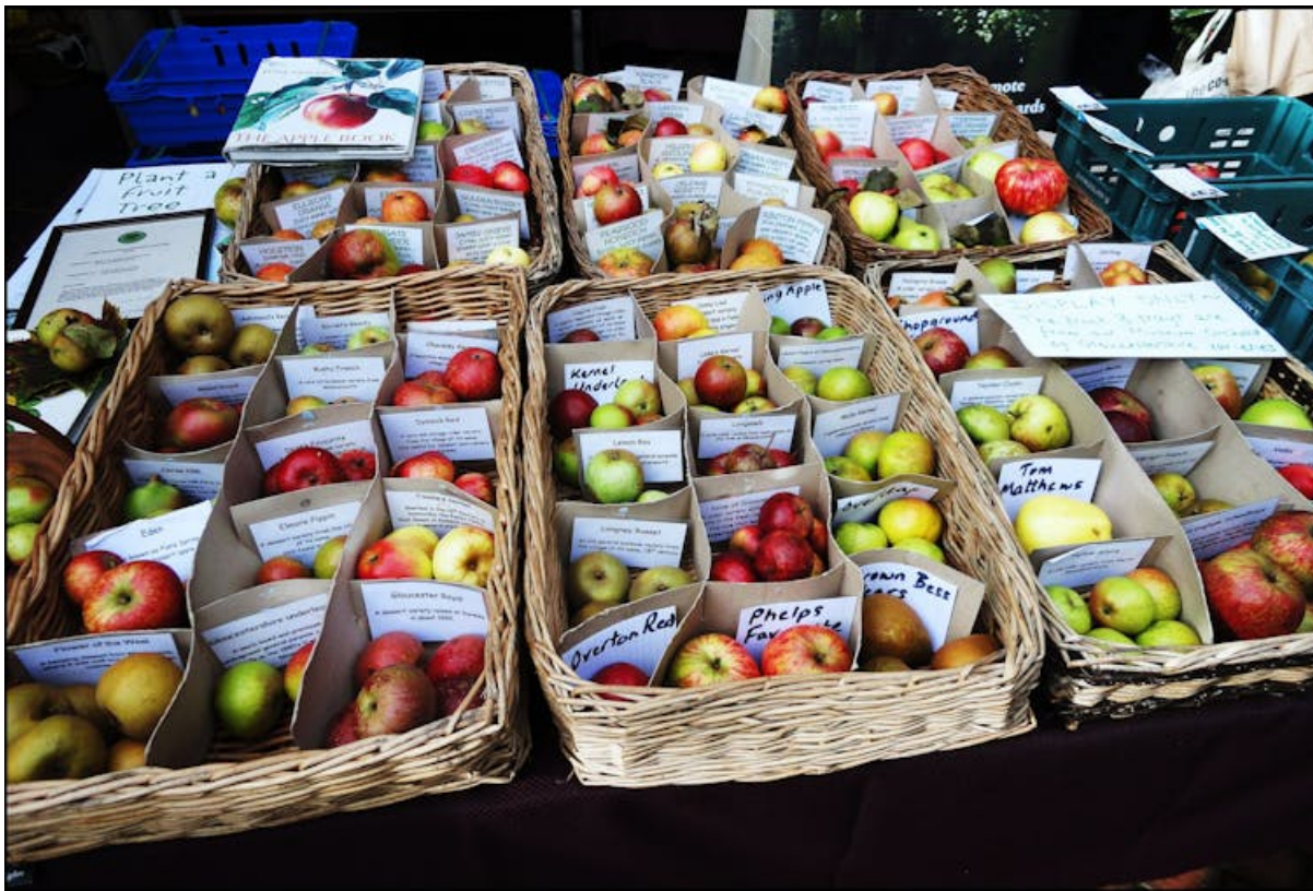
Heirloom apples, Stroud Farmers Market, Gloucestershire, England.